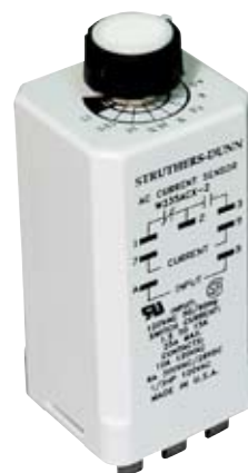
235 Wire Diagram