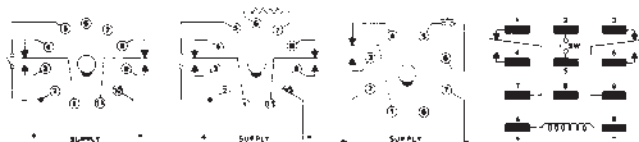
DPDT 11 Pin Plug-in RB-11/PF113A DPDT 11 Pin Plug-in External Resistor Adjustable RB-08/PF083A SPDT Octal Plug-in RB-08/PF083A DPDT Blade Plug-in 70-463-1