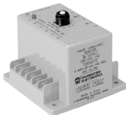
Phase Unbalance & Loss Monitor