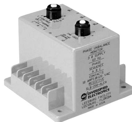
Phase Unbalance Monitor

NOTE: A balanced condition exists and the output relay will energize when there is a complete absence of voltage on all three phases (Terminals 1, 3 and 5) and the control voltage is continuously applied to (Terminals 11 and 12). For this reason, the SLB series is ideally suited for load side monitoring applications.